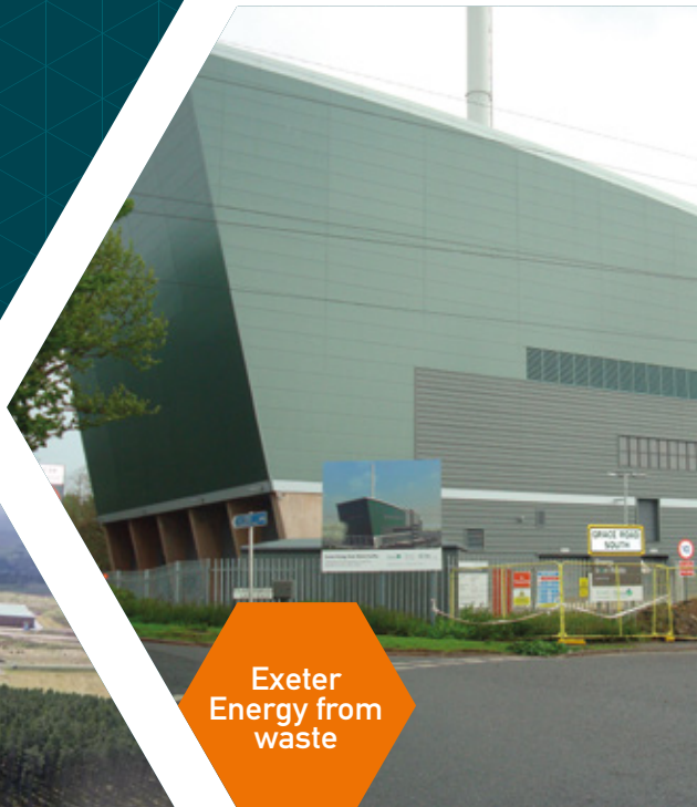
Exeter Energy from waste