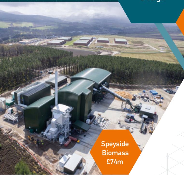
Speyside Biomass £74m