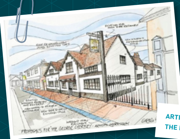
ARTIST IMPRESSION OF THE FINISHED BUILDING